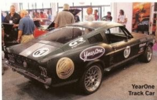
YearOne Track Car