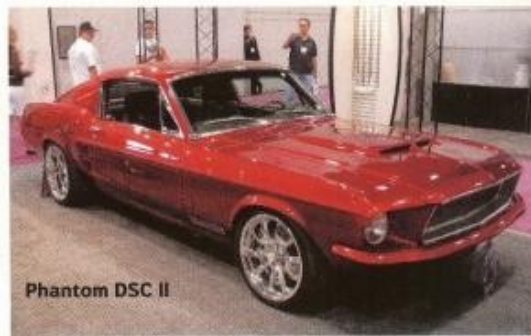
Phantom DSC II